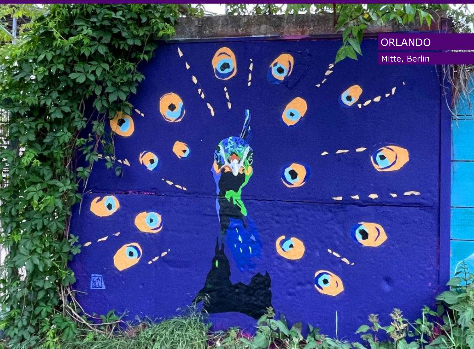
ORLANDO Mitte, Berlin