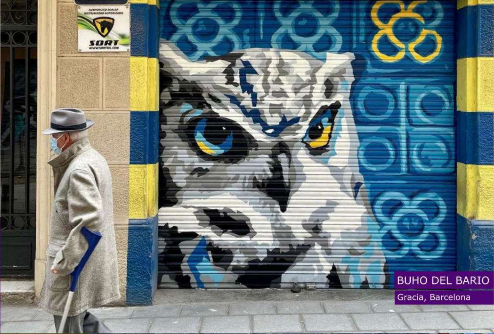
BUHO DEL BARIO Gracia, Barcelona