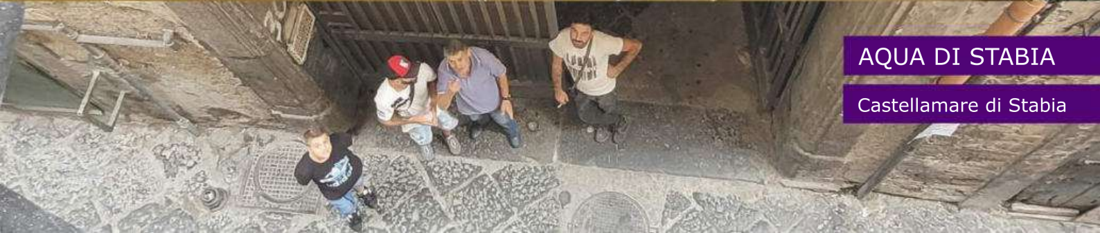
AQUA DI STABIA Castellamare di Stabia