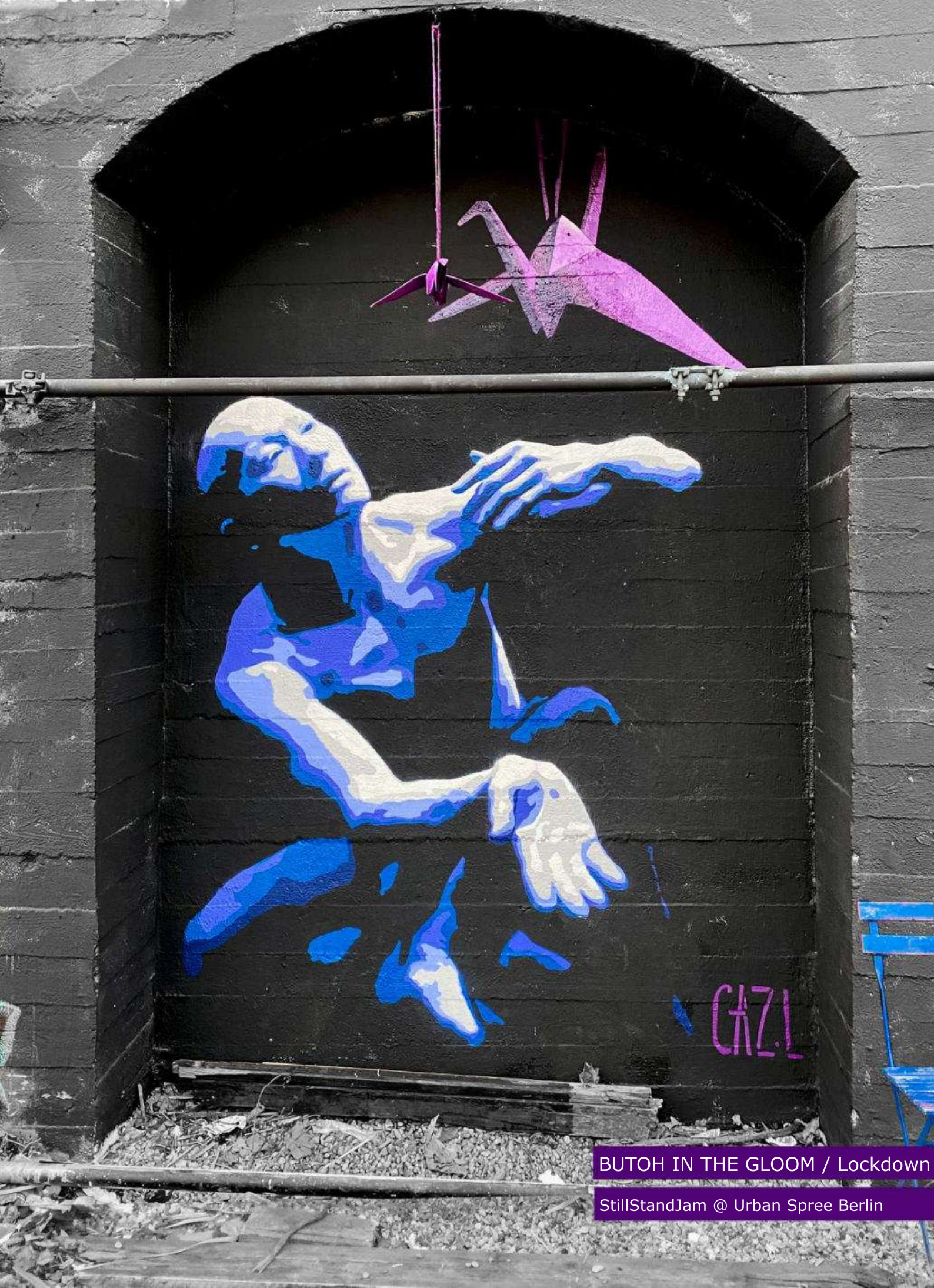
BUTOH IN THE GLOOM / Lockdown