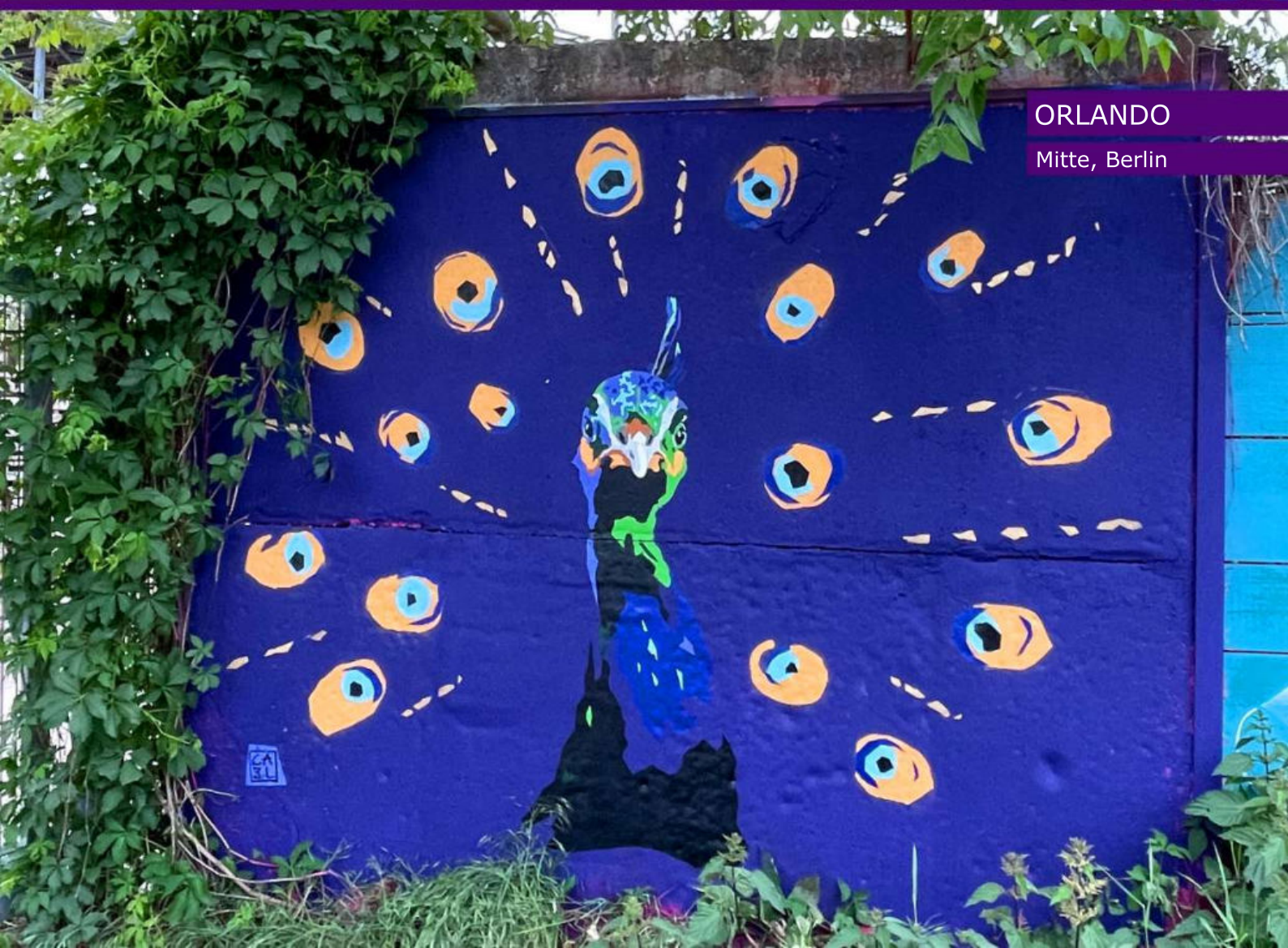
ORLANDO Mitte, Berlin