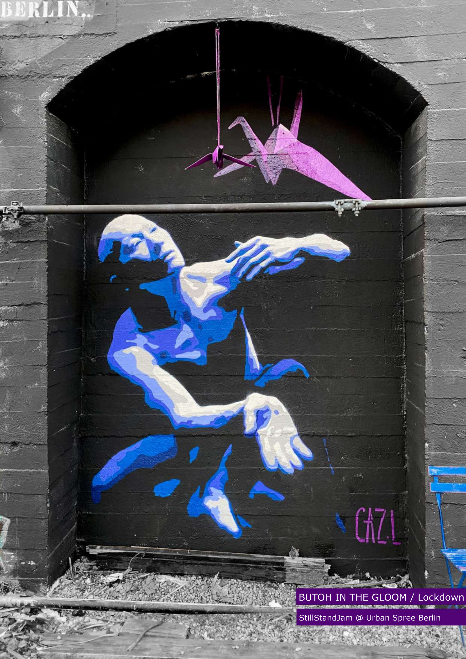
BUTOH IN THE GLOOM / Lockdown