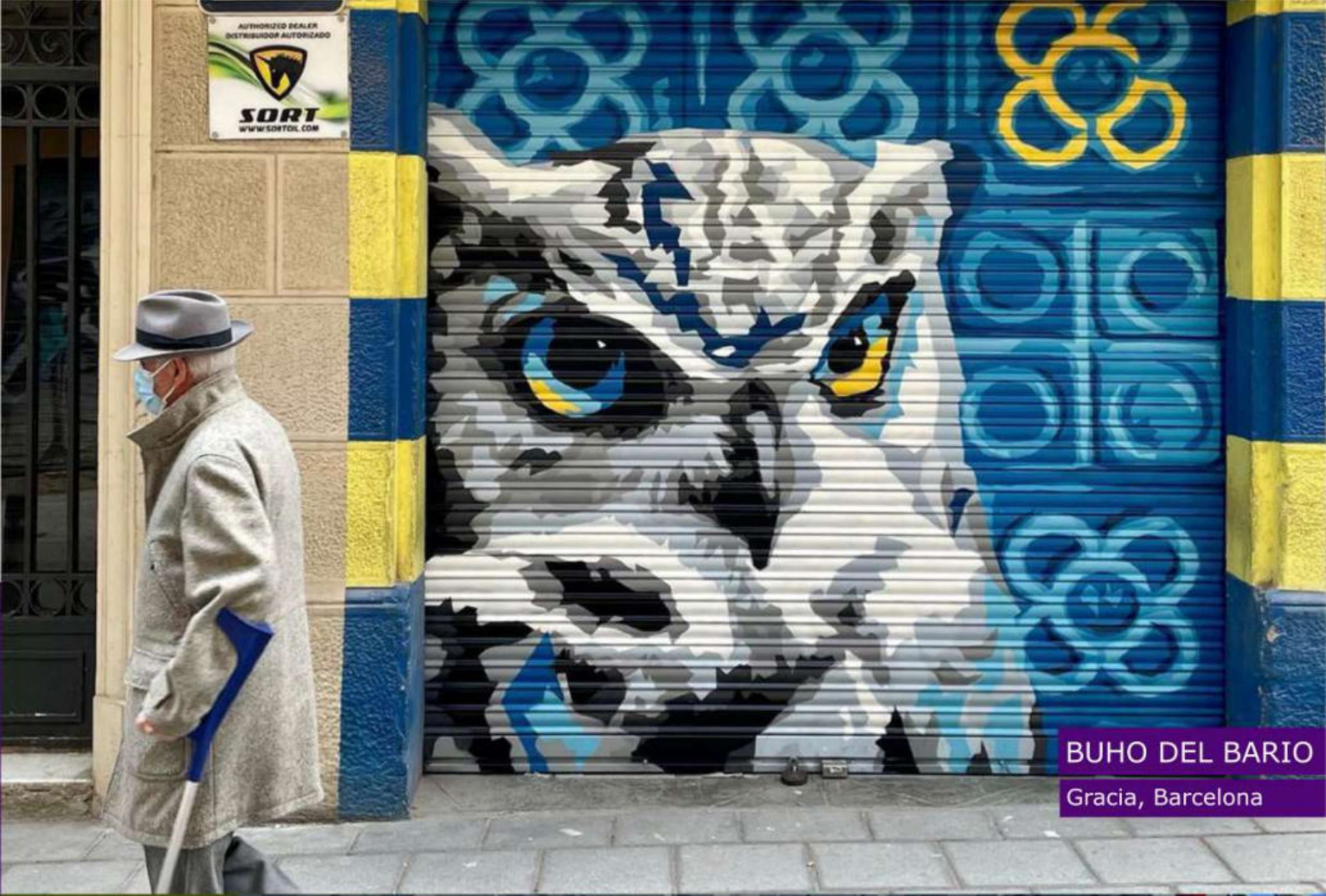
BUHO DEL BARIO Gracia, Barcelona